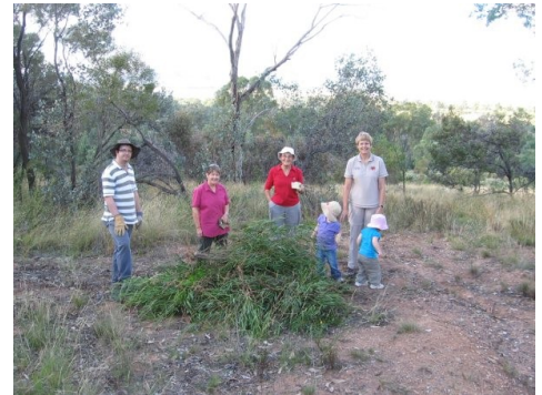
Field Nats hard at work at the Arboretum

Sunday morning remained rainy, so members made their own decisions on whether to stay or leave for home. A good time was had by all.