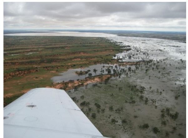
The Paroo in flood

It was also interesting to note the flooding on the new National Park 'Toorale' and the wetlands and water structures present on the property.