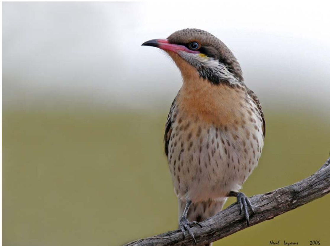
Spiny-cheeked Honeyeater